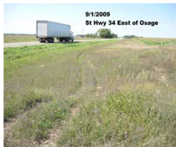
Spotted knapweed, such as this site, are being treated with knapweed weevils for bio control.