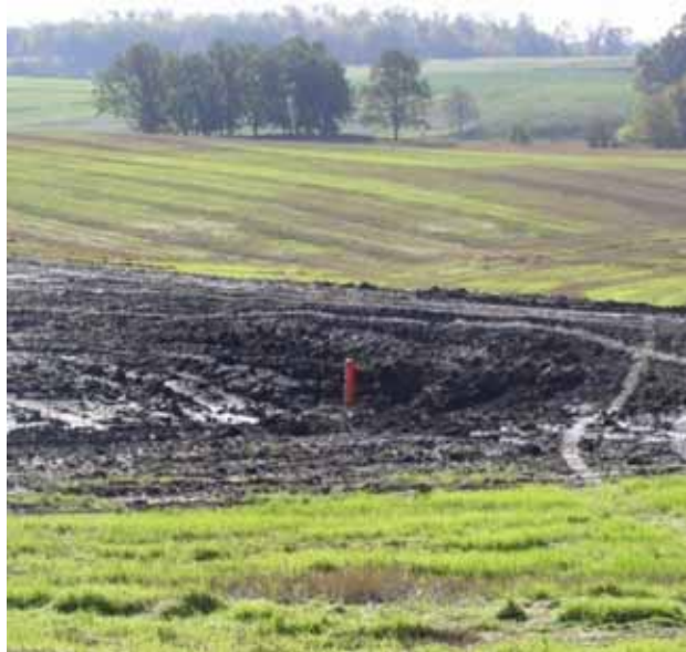
One of 57 water and sediment erosion control basins that was installed in 2009 in Becker County.