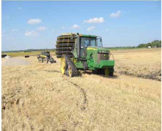
Drain tile being installed as part of an water erosion and sediment control system. Once in place the inlet and dike are installed to allow for a controlled release of water down the hillside, thus reducing soil erosion and sedimentation.

In 2009 payments to landowner for installing conservation practices totaled $443,289.00. Practices installed were the following: