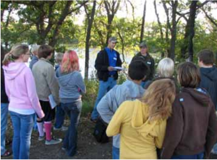
Senior High students listen to presentation at the Forestry station during the 2009 Senior Envirothon held May 8 th at the Prairie Wetlands Center in Fergus Falls, Minn.